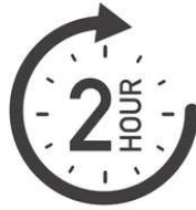
Run time for uninterrupted cleaning