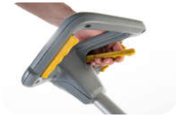
Ergonomic handle with Unlocking System