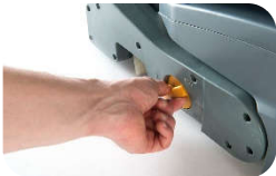
Adjustable down pressure by knob (3 steps)