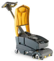
Fast and easy maintenance